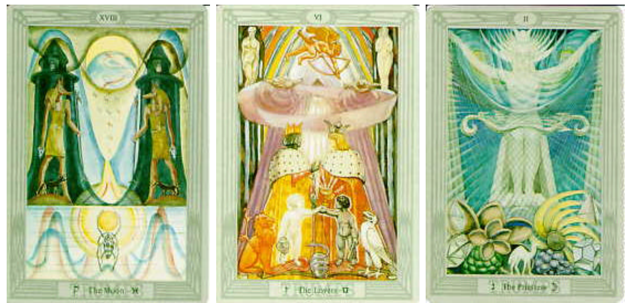
The Moon, the Lovers, and the Priestess from the Thoth deck.

1938-1943: Aleister Crowley designed the Thoth deck, which was painted by Lady Frieda Harris. Though Crowley published his study of the Tarot, The Book of Thoth in 1944, the deck itself was not published until 1969, by which time both designer and artist were dead. Thoth is the Egyptian god said to be the inventor of hieroglyphics. Like the Waite-Smith deck, the Thoth deck is full of esoteric symbolism, combining important symbolic aspects of earlier decks with Kabbalistic, astrological and alchemical references.