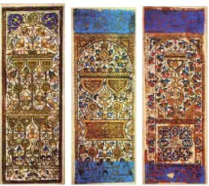
Islamic Mumlak cards, 15<sup>th</sup> century

1375-1378: Playing cards were introduced to Europe from the Islamic invasion of North Africa, Spain and Sicily by Islamic forces during the Mamluk Sultanate of Egypt which did not end until 1517. These playing cards were an adaptation of the Islamic Mamluk cards which had suits of cups, swords, coins, and polo sticks (seen by Europeans as staves). The court consisted of a king and two male underlings.