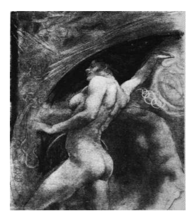
"Laughing aloud, Zos answered"

deliberations. O thou syzygy of my I and Self! Thou becomest volatile to whatsoever is sensed. Art thou the hidden wish for madness and hysteric love? O thou "untamed" within, thou shall not lose virtue-for thee I will not domesticate while generating. O idiocy! where is that path where I may wander naked in frenzy, a trespasser against all things reasonable? O time! saith good and evil: 'Come, come! Ego, I come!'