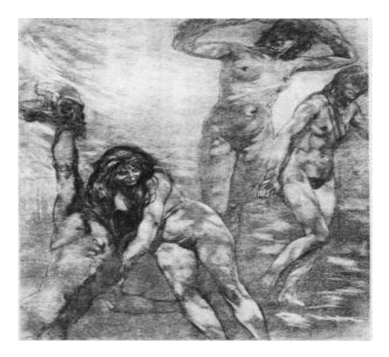
"All things are possible even in nightmares"

You would have prophecy? First tell me your sleeping partner's name . . . . What once evoked a mighty passion-is now repulsive; lest ye forget: sleep alone. If you yourself cannot be ungodly-then nothing will convert you.