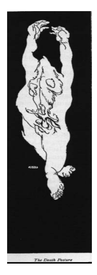
"The Death Posture"

From these the new body is determined and parentage selected by the laws of attraction. The wise man makes sure of his future parents and a male incarnation before death. Consciousness [for most, only three dimensions] is not so definite as in life but to the extent of your will in life, that much is your consciousness in death. Death is the manufacture of life. A dream is a sore likeness of Life. Death is a sore dream of life. Its period depending on the perfection or otherwise of the individual but closely follows in duration the previous life-till re-incarnation. Death being a living nightmare of life, has painful possibilities-in the degree of unified consciousness. A ghostly world of 'perhaps' where all the vague potentialities of desire, are incarnating. There is no women as such. Again I say, death is the great chance and there grasp where thou hast before failed in body. If fate is life, then death is the hazard to alter fate! A world where will creates the afterthought in its own image. For most, death will hold mainly blank pages, but were we ever treated all alike? Study your dreams in this life, it may help you in the death posture.