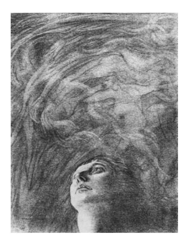
"Aàos was watching the waters"

ever present portraiture of experience to satisfy the ovine: No obvious allegory of assesthinking God: No still-life group of empty bottles and old maids commonplaces: Nor the gay-tragedy of song. But stange desires of stranger arcana. The law I make while thinking God-and will smash and remake again: so that I may commit every conceivable sin against its word. My utility has been-my pleasure-that alone is my service to man and to heaven, in that I am the Goat." After his devotion Aaos prepared for the Death posture and judgement. Awaking from the awful wrath-his teeth chattering, his limbs shivering and drenched with a cold perspiration, he allowed the ague to exhaust itself and thought thus: "Verily, I have nothing to forgive or repent . . . Alas! what fears this I but its own conditions? Man will create the faster moving body outside himself-always prefering compulsion to the infinite possibilities of freedom.