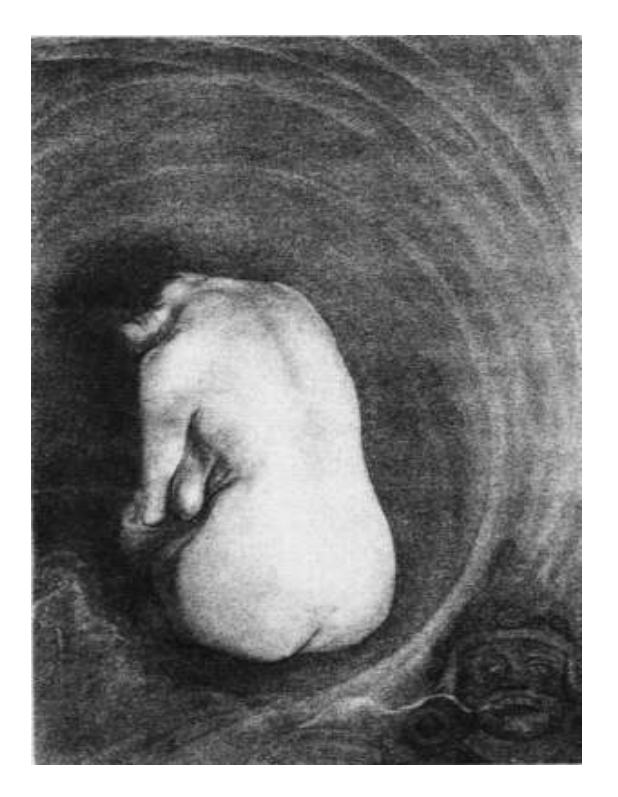
"The soul is the ancestral animals"