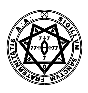
A::A: Publication in Class A